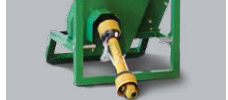
Tractor mounted PTO driven , suitable for any small tractor with 12 to 35HP. Connected to the three point linkage of your tractor. Designed for PTO speed of 540 rpm. Drive shaft is fitted with shear pin.