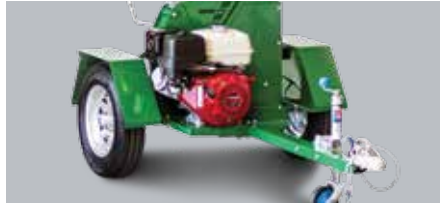
Road trailer version , complete with mudguards, lights and coupling, for towing on highways. The ideal option for hire centres and contractors or if you have more than one property.